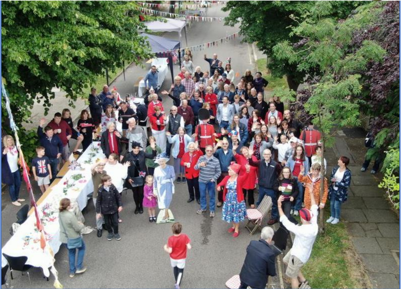
QUEEN'S PLATINUM JUBILEE PLUS NATIONAL NEIGHBOURHOOD WATCH WEEK

Merton Neighbourhood Watch groups celebrated the Queen's Platinum Jubilee during National Neighbourhood Watch Week, which also marked the 40th Anniversary of the Neighbourhood Watch movement. There were so many celebrations that it is impossible to share them all! Above are residents from Erridge Road, Merton Park celebrating, whilst below are pictures from the Garth Close street party which fundraised for St Raphael's Hospice.