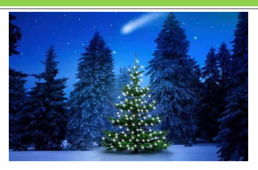
Editor's Message Merry Christmas and a Happy New Year!

We would like to take this opportunity to wish you a happy Christmas and New Year and to thank you for all your support in 2023.