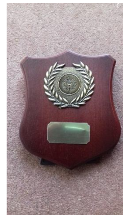
Jack Sims Trophy - Small

Soon we will be presenting the Jack Sims Award for the best Neighbourhood Watch logo developed by a Year 5 pupil during 2018.